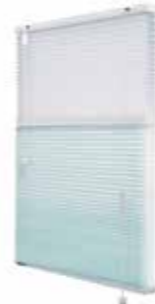
CORDED DAY & NIGHT