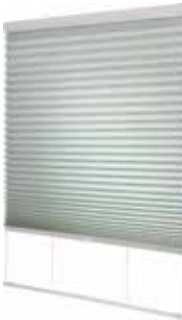
SMARTRISE™ FOR SLOPED WINDOWS