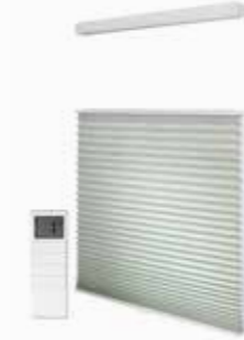
MOTORISED TOP DOWN