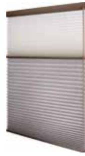
CORD LOOP DAY & NIGHT