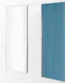
PATIO DOOR VERTICAL DAY & NIGHT