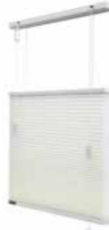
CORDED TOP DOWN/ BOTTOM UP