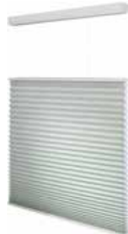
CORDLESS TOP DOWN/ BOTTOM UP