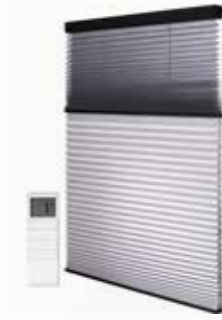
MOTORISED DAY & NIGHT