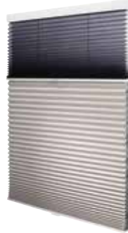
CORDLESS DAY & NIGHT