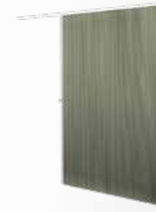
PATIO DOOR VERTICAL