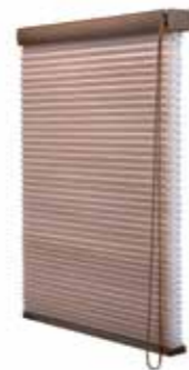
CORD LOOP & SMARTRELEASE™