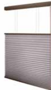
CORD LOOP TD